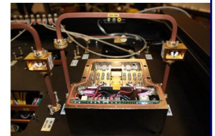
60 GHz System Checkout