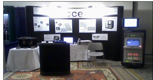
High Power – 200W RF, 400WDC Active Cooling Sub-System on Display

Typical performance of the air-cooled DUT chamber can achieve baseplate temperatures of <50^{\circ}\text{C} for power dissipation of 60Watts and the liquid-cooled DUT chamber can achieve baseplate temperatures of <15^{\circ}\text{C} for device power dissipation of 200Watts.